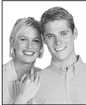
SMALL PHOTO - approx. size 2"x2.25" (this photo not actual size)