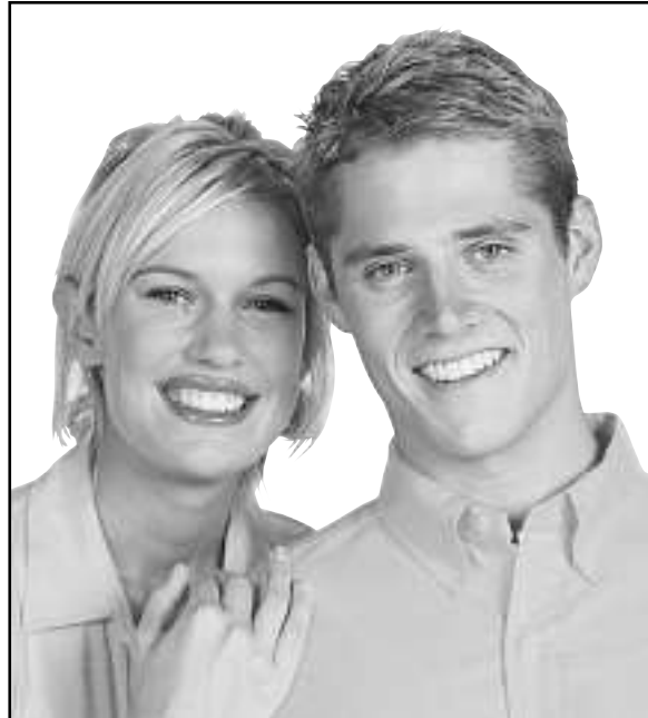
LARGE PHOTO - approx. size 4.5"x4" (this photo not actual size)